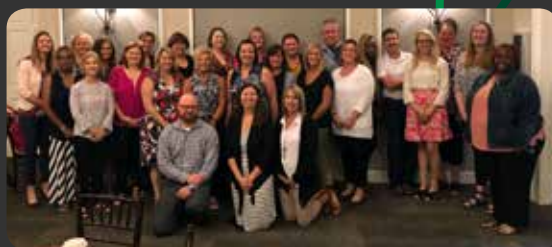
Kinnect convened 30 Days to Family® Ohio staff from throughout the state to engage in an all-day joint learning community.